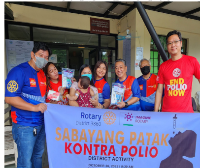
Hygiene Kits Distribution