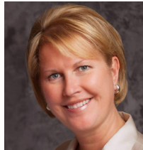
Jennifer Jones Rotary International President