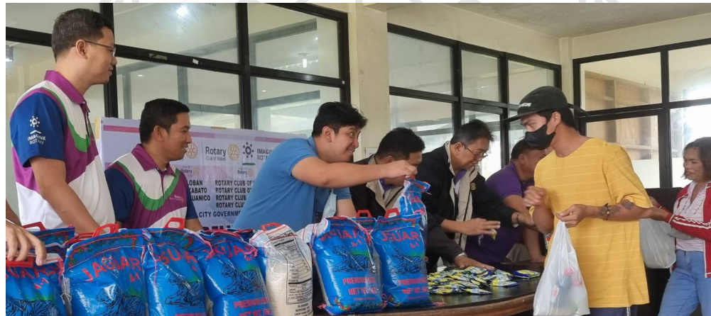
January 26, 2023 - Peace & Conflict Prevention/Resolution