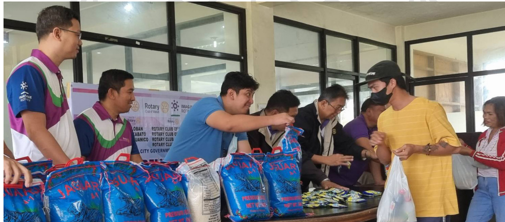
January 26, 2023 - Peace & Conflict Prevention/Resolution