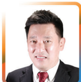
Andrew P. Ng Membership