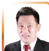
Andrew P. Ng Membership