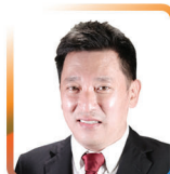
Andrew P. Ng Membership