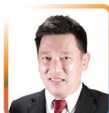
Andrew P. Ng Membership