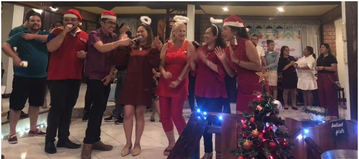
Area 1 Fellowship Christmas Party December 8, 2018 Bohol Bee Farm Daus