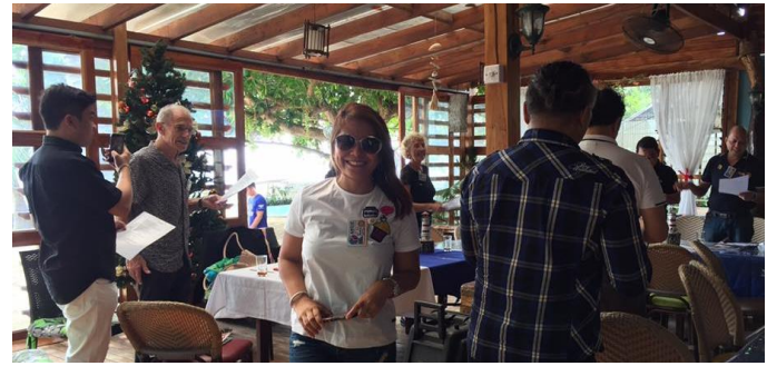
Rotary Club of Tagbilaran on its 17 th Rotary Fellowship Meeting; Tropical Villas November 29, 2017