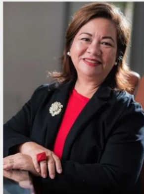
DGE Lilu Alino RY 2022-23