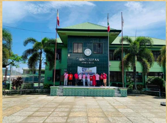
10 th & Last Stop: Guindulman, Bohol