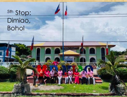
5 th Stop: Dimiao, Bohol