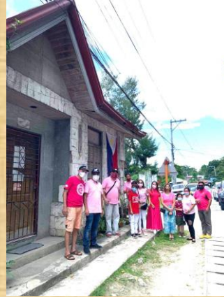
Second Stop: Municipality of Albuquerque, Bohol