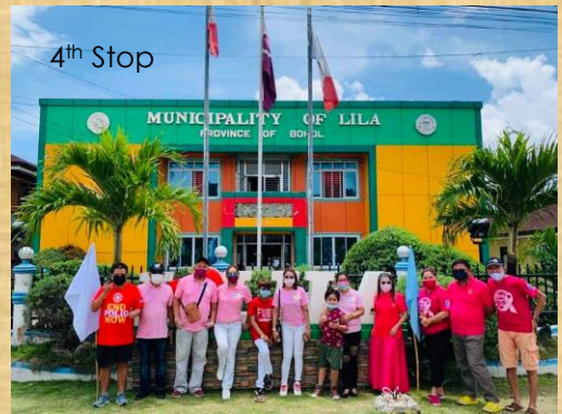
4 th Stop