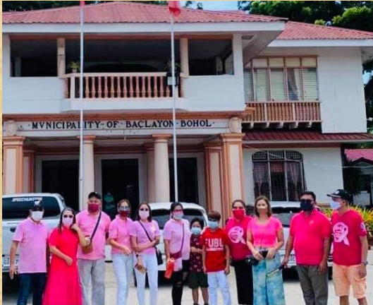
First Stop: Municipality of Baclayon, Bohol