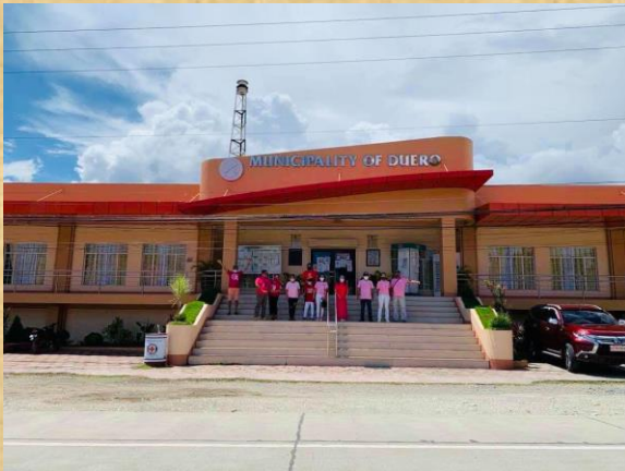
9 th Stop: Duero, Bohol