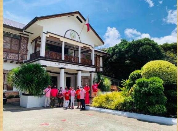
8 th Stop: Jagna, Bohol