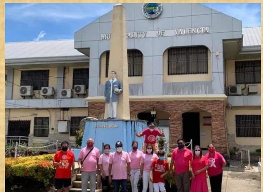
6 th Stop: Valencia, Bohol