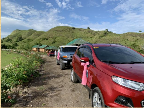
CABANTIAN HILLS, Guindulman, Bohol