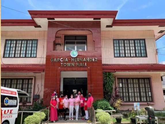
7 th Stop: Garcia-Hernandez, Bohol