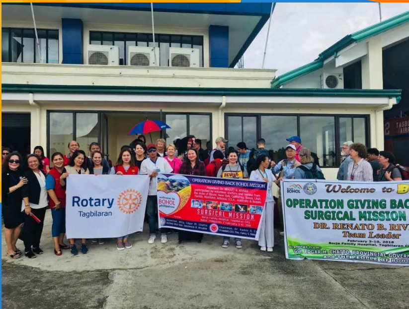
The Rotary Club of Tagbilaran welcomes the Doctors from America for the Surgical Mission