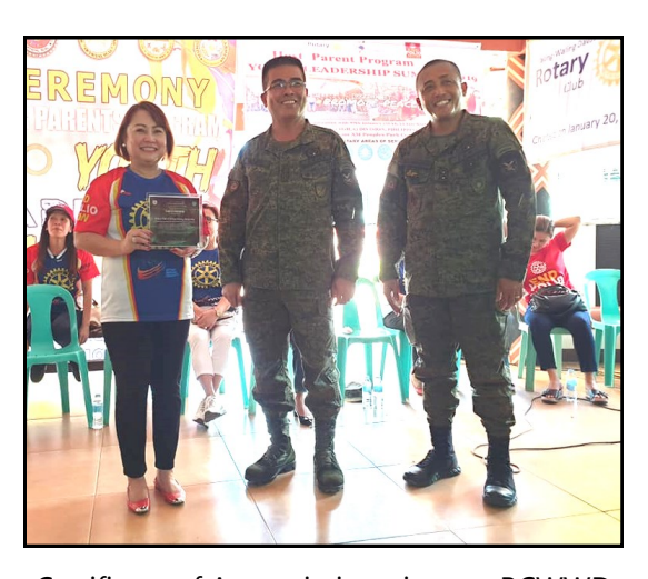
Certificate of Appreciation given to RCWWD

Page 06 BLOOMSCOOP Vol. 28 Issue 18 28 November 2019