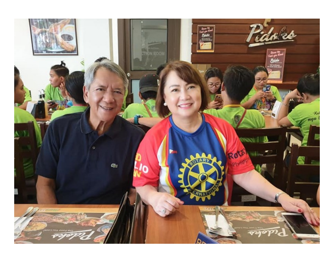
with spouse Bong