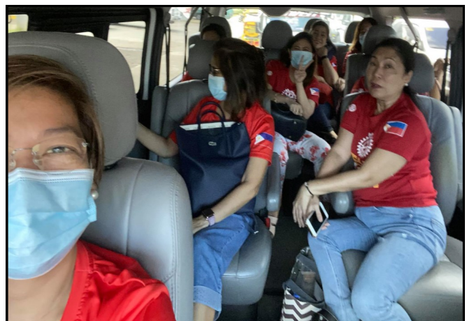
2.9.2020: on our way to Marilog Dist. for Book Donation - more photos next week

I am eager to see our bulletin every week.