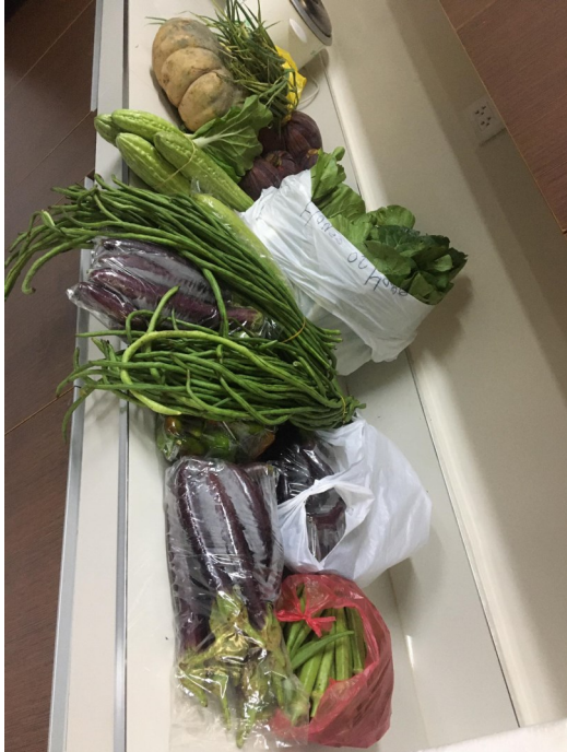
September 22: Some of the veggies donated by Rtn Gina Espejo at House of Hope