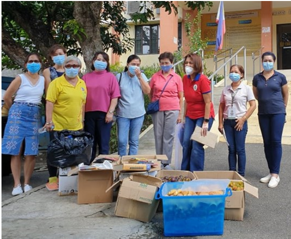
September 22: RCWWD brought some books and used clothing to Bahay Pag-asa