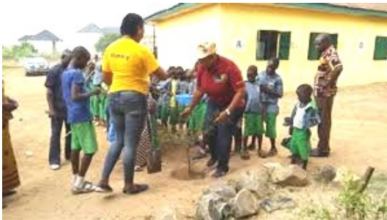
RC Abuja Life camp