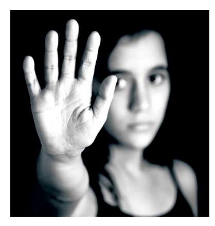
Prevent Domestic Violence

Through our service projects, peace fellowships, and scholarships, our members are taking action to address the underlying causes of conflict, including poverty, inequality, ethnic tension, lack of access to education, and unequal distribution of resources.