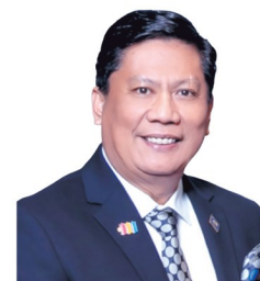
Rodel Riezl Reyes District Governor