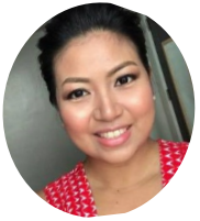
DIR MAEM CUA-ZHANG (Public Image)

"The foundation upon which Rotary is built is friendship; on no less firm foundation could it have stood."