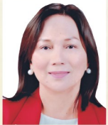
Luna E. Gaviola Gen. Bldg., Construction ID# 5134392