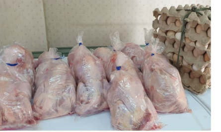
Pamalengke para sa HOH Food ration delivered March 23, 2021 Whole <u>dressed</u> chicken <u>Antibiotic free eggs</u>