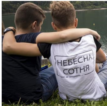
Poland: Healing the scars of war