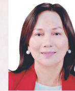
Luna E. Gaviola Gen. Bldg., Construction ID# 5134392