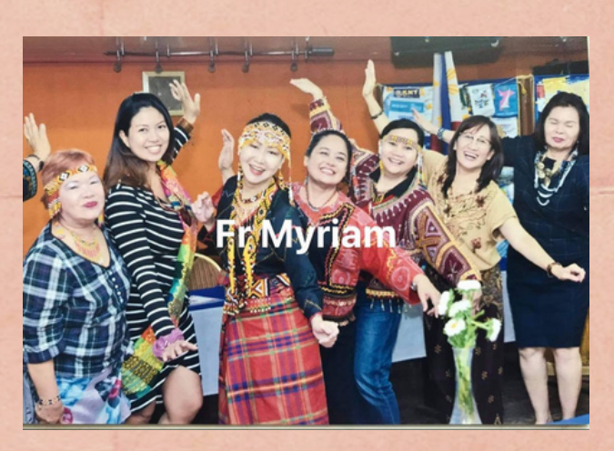
"I love being a Rotarian because who says we can't have fun?"