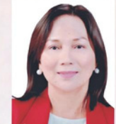
Luna E. Gaviola Gen. Bldg., Construction ID# 5134392