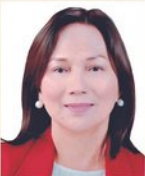
Luna E. Gaviola Gen. Bldg., Construction ID# 5134392