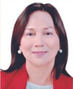
Luna E. Gaviola Gen. Bldg., Construction ID# 5134392