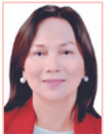
Luna Gaviola General Building Construction ID#5134392