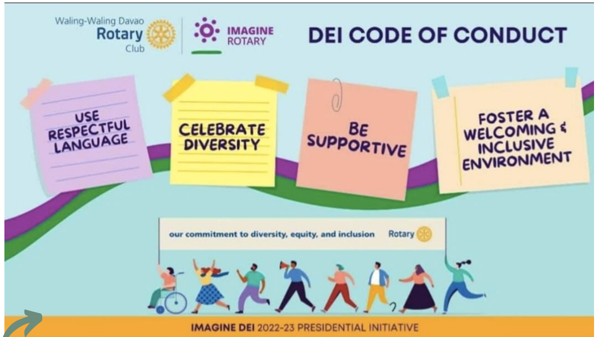
Official DEI tarpaulin of RC Waling-Waling Davao