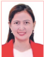
Chona Lamparas Party Needs Supplier ID#10808598