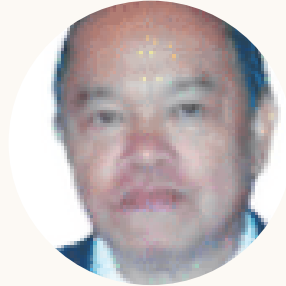
HM PP NONOY AQUINO AUGUST 25