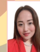
Caryl Lim Furniture & Houseware Retailing ID#11539204