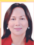
Luna Gaviola General Building Construction ID#5134392