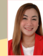
Irish May Tan Fish Farming ID#11539191