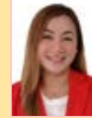
Irish May Tan Fish Farming ID#11539191