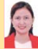
Chona Lamparas Party Needs Supplier ID#10808598