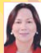
Luna Gaviola General Building Construction ID#5134392