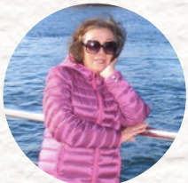
PP Fe Boiser December 28, 1996