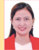
Chona Lamparas Party Needs Supplier ID#10808598