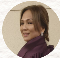
Dir. Luna Gaviola December 5, 2002