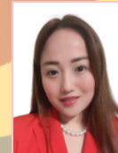
Caryl Lim Furniture & Houseware Retailing ID#11539204