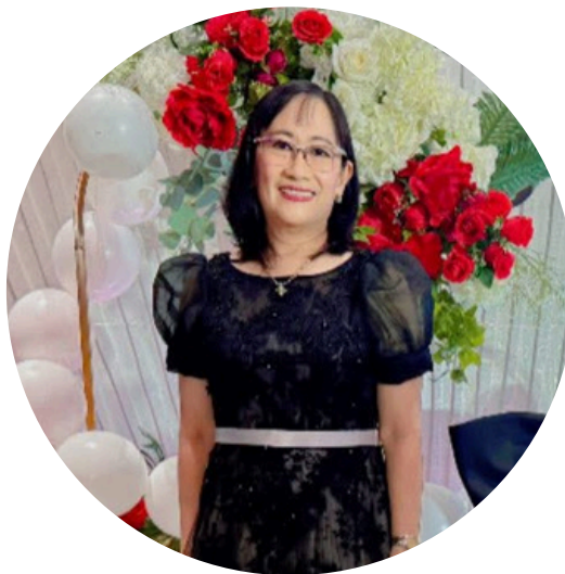
PP Melot Baarde