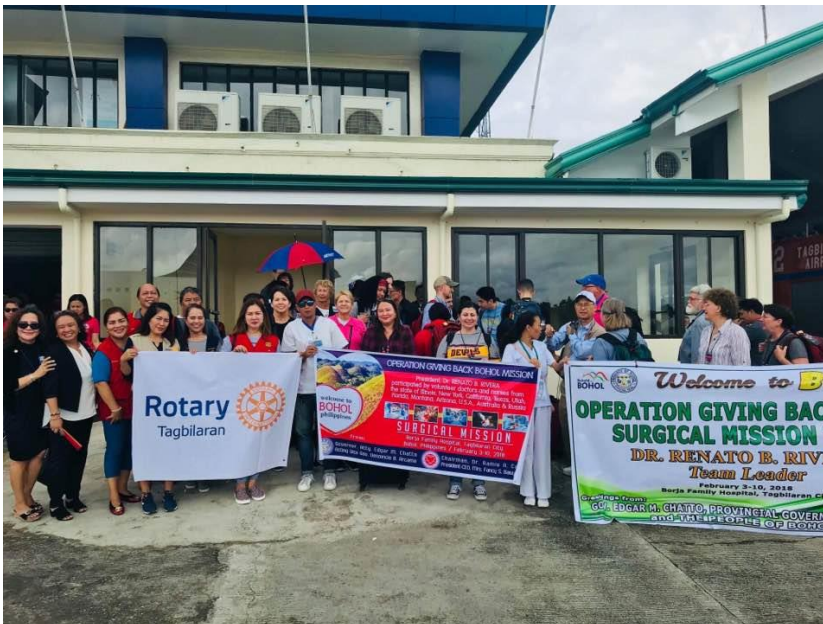
The Rotary Club of Tagbilaran welcomes the Doctors from America for the Surgical Mission