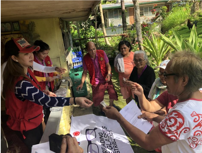
The Rotary Club of Tagbilaran on its Reading Eye Glasses Distribution in Laca, Jagna, Bohol