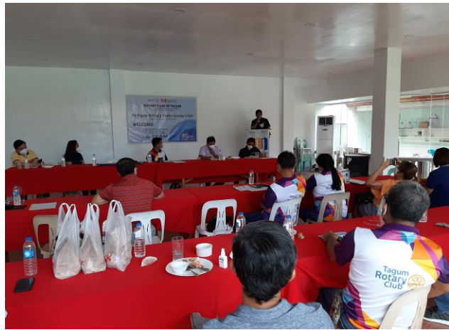
7TH REGULAR MEETING AT LYR PAVILION 10/01/2020