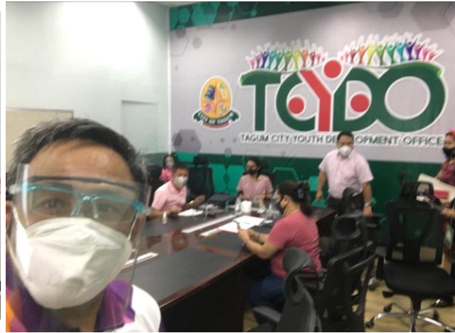
TURNOVER OF KAMAY GABAY KITS 10/28/2020