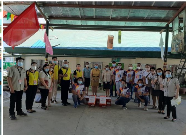
MAKIPAPEL BOND PAPER DONATION 10/01/2020